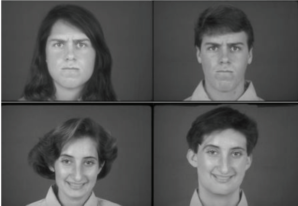
Figure 3. Changing hairstyles to change perceived gender

but not of these social motives. Thus, by combining androgynous interior faces with male and female hairstyles, apparent men and women with identical facial appearance can be created (see Figure 3).