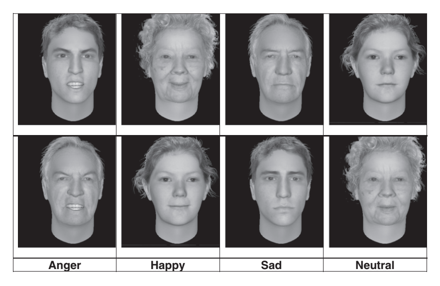
Fig. 1. Examples of experimental stimuli.

To test the hypothesis that participants perceived emotions less accurately and more inaccurately when shown in an old face, a 2 (young, old face) \times 3 emotion (happy, angry, sad) analysis of variance was conducted on the accurate and inaccurate ratings respectively. A main effect of emotion (accurate: F(2,63) = 13.61, p<.001; inaccurate: F(2,63) = 4.61, p=.014) and an emotion by age interaction (accurate: F(2,63) = 58.46, p<.00; inaccurate: F(2,63) = 92.63, p<.001) emerged for both variables. For inaccurate ratings, a main effect of age emerged as well, F(1,64) = 14.67, p<.001), which was qualified by the interaction. Overall, inaccurate ratings were lowest for happy expressions, and accurate ratings were highest for anger expressions.